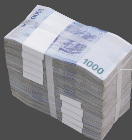
pp band strapping

www.bindtec.kr TEL : +82 31 734 2868 FAX : +82 31 734 2869 E-MAIL : sales@bindtec.kr #1011,177, Sagimakgol-ro, Jungwon-gu, Seongnam-si, Gyeonggi-do, South Korea, 13202